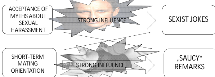
Fig. 3: Double dissociation of the two dispositions in the prediction of two forms of sexually harassing behaviors and differential effects of activation of a power motive vs. activation of a sexual motive