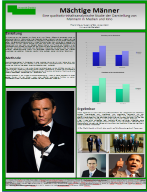
Fig. 1: Poster depicting „powerful men“

Contact: Charlotte.Diehl@uni-bielefeld.de